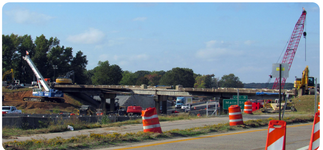
N. James Street Bridge demolition