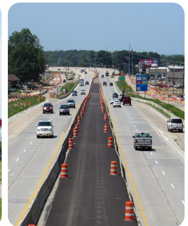
Left: New yield at TP White Drive and Hwy. 67/167 Exit Ramp 11A (Vandenberg Blvd.) Right: Highway 67/167 median work to widen the highway.