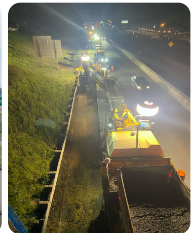
Left: John Harden Drive converted to one-way road. Picture taken near N. James St. Right: Crews working to temporarily widen Highway 67/167.