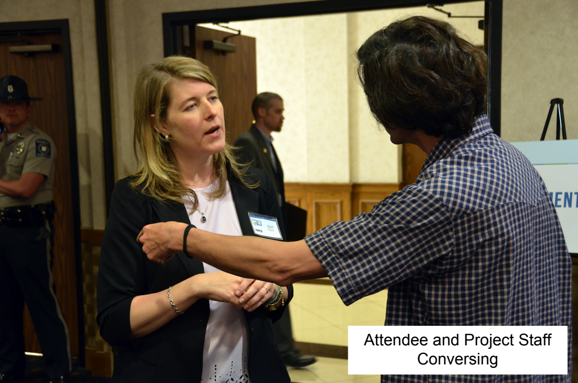
Attendee and Project Staff Conversing