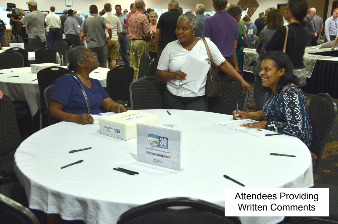
Attendees Providing Written Comments