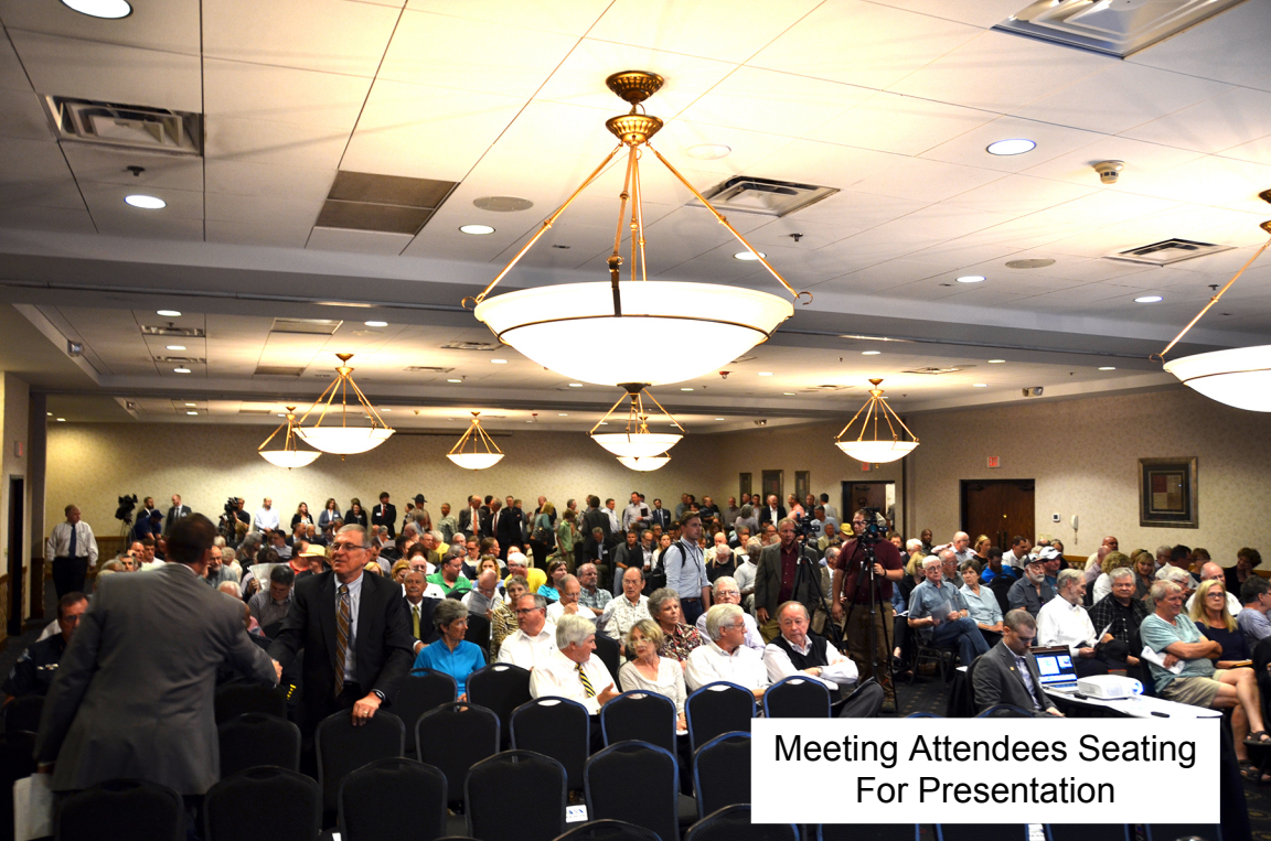
Meeting Attendees Seating For Presentation