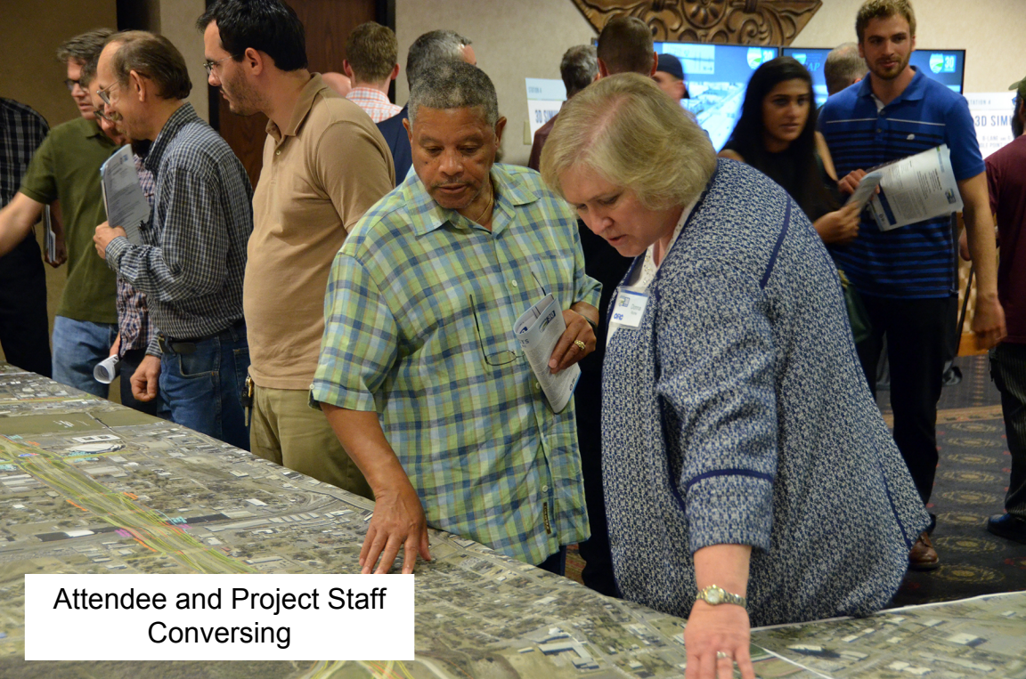
Attendee and Project Staff Conversing