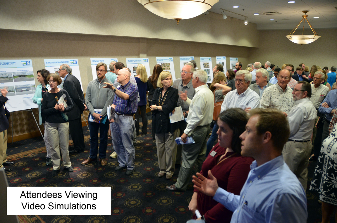
Attendees Viewing Video Simulations