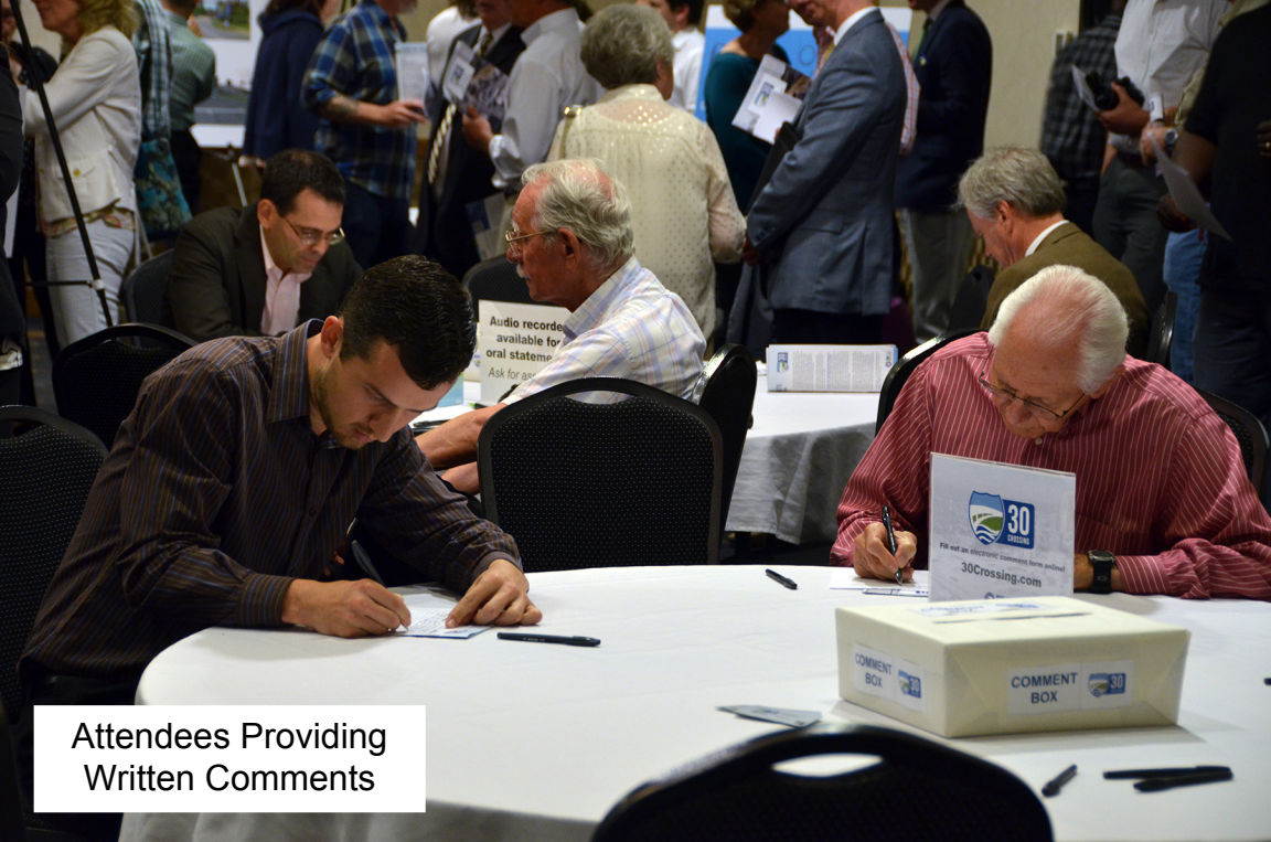
Attendees Providing Written Comments