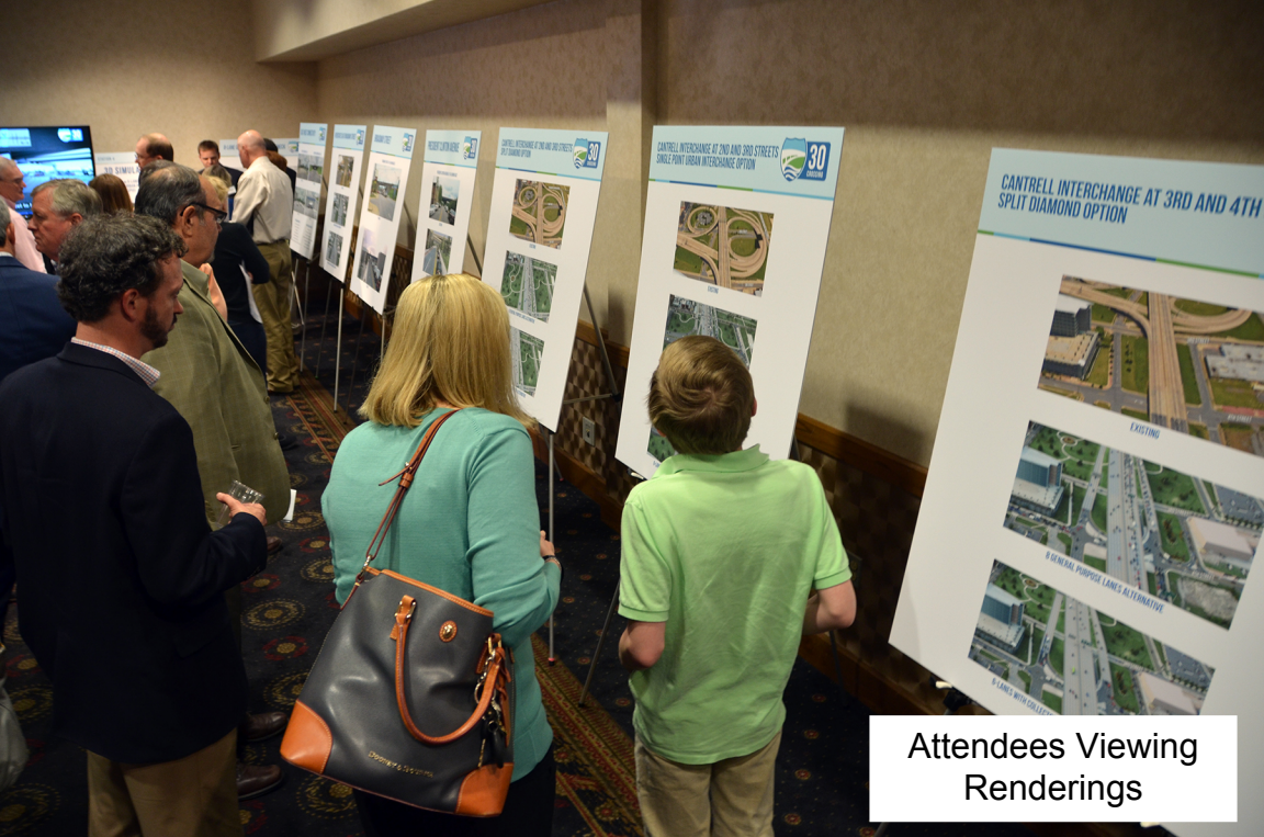
Attendees Viewing Renderings