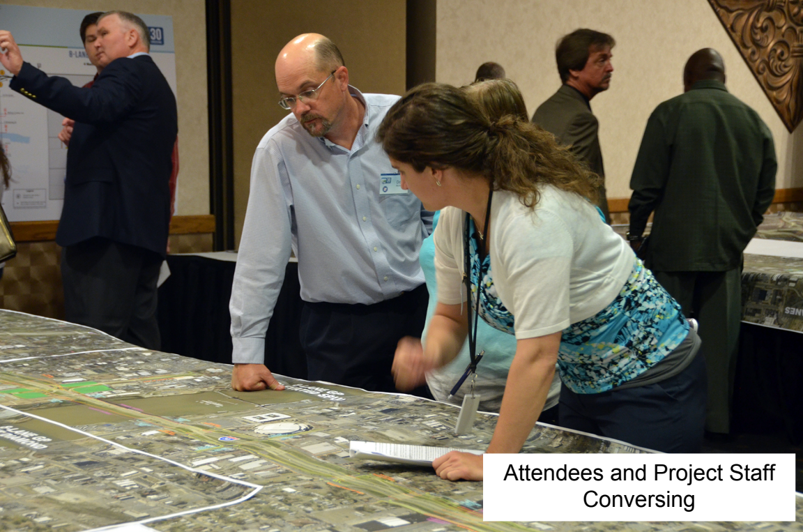
Attendees and Project Staff Conversing