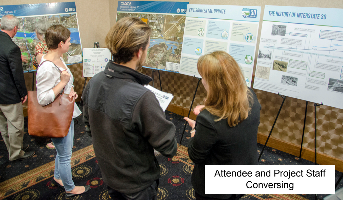
Attendee and Project Staff Conversing