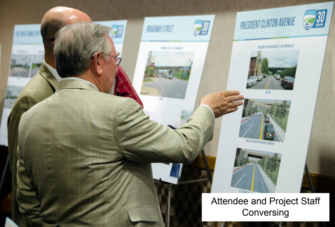
Attendee and Project Staff Conversing