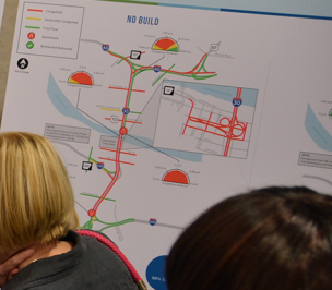
Attendees and Project Staff Conversing