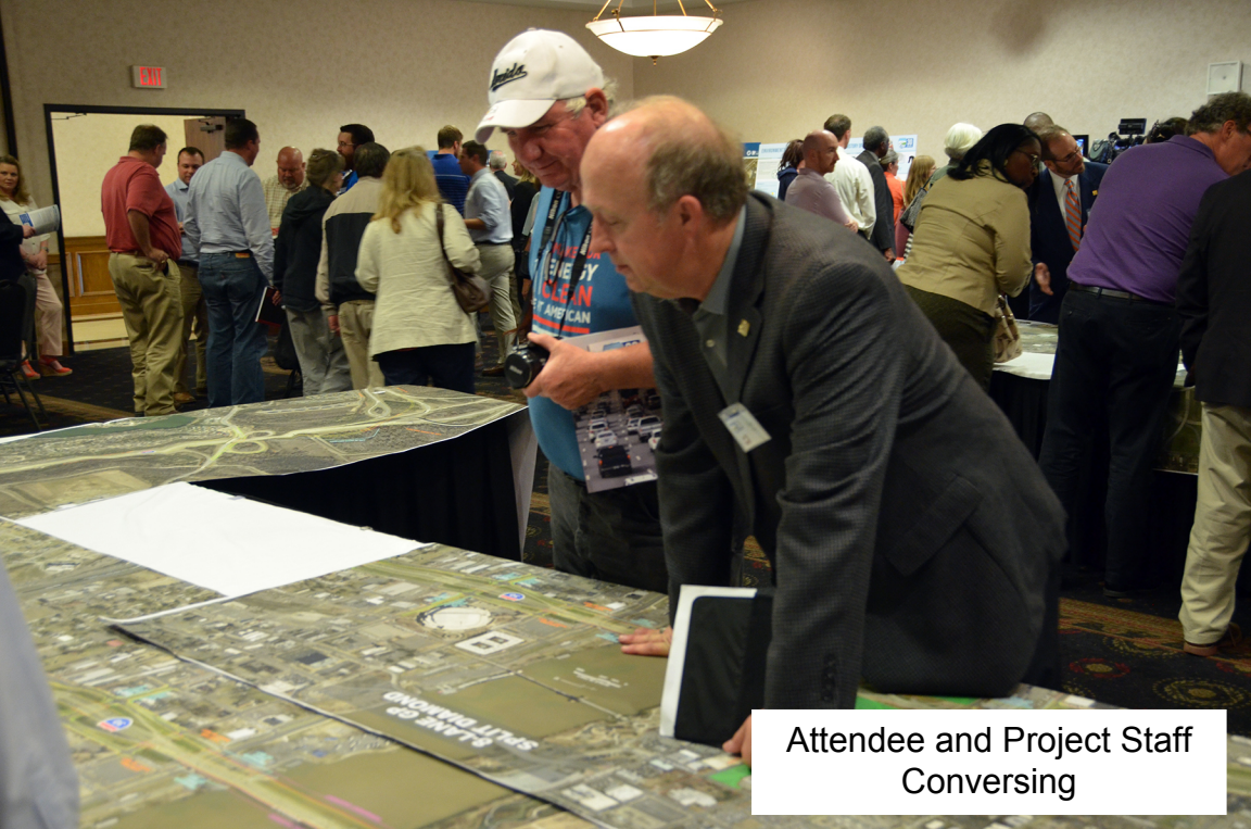
Attendee and Project Staff Conversing