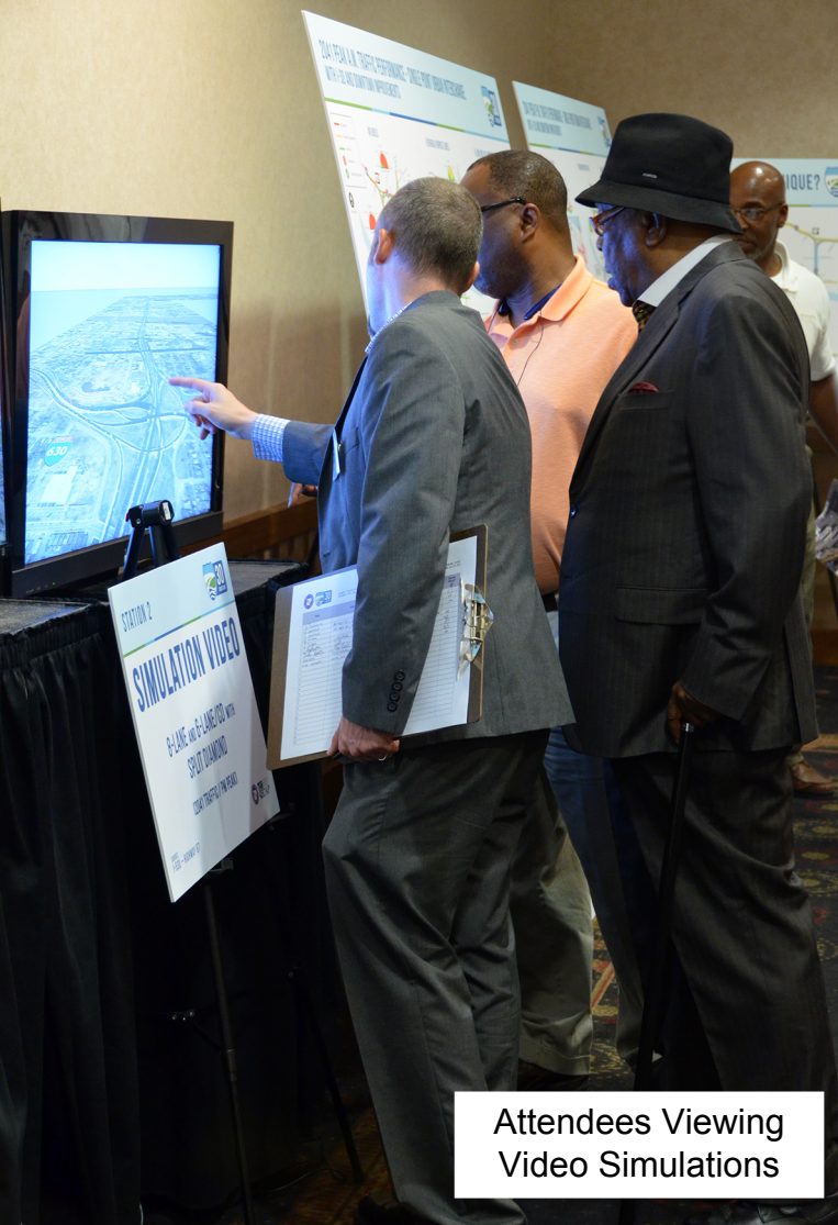
Attendees Viewing Video Simulations