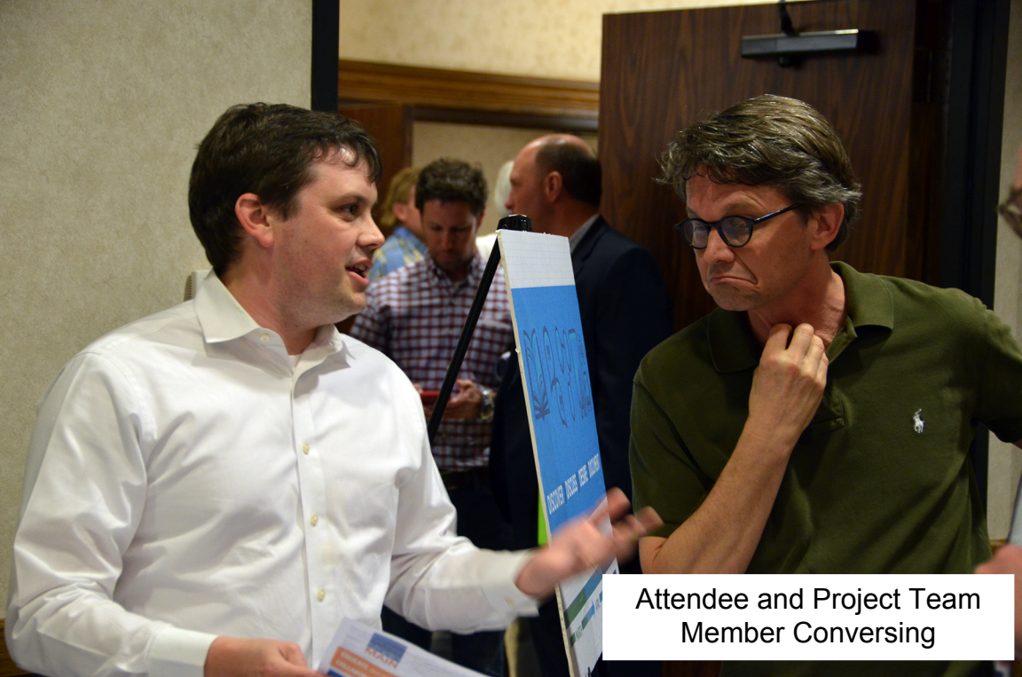
Attendee and Project Team Member Conversing