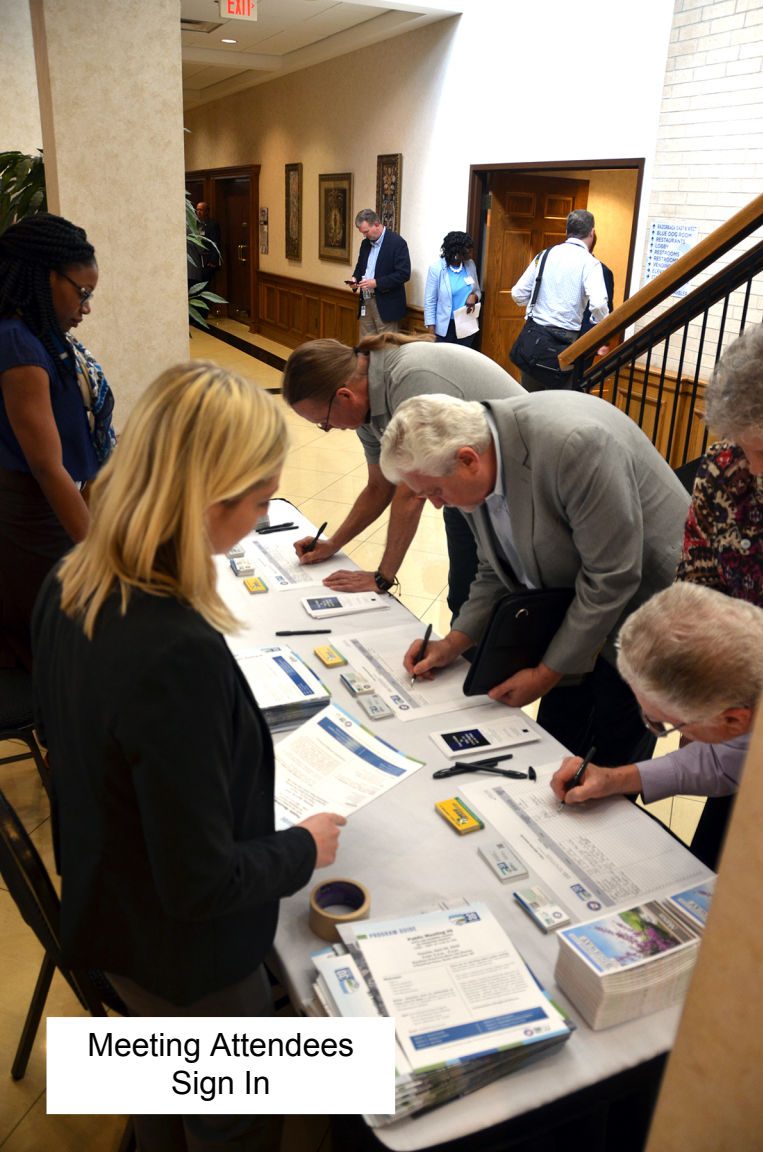
Meeting Attendees Sign In