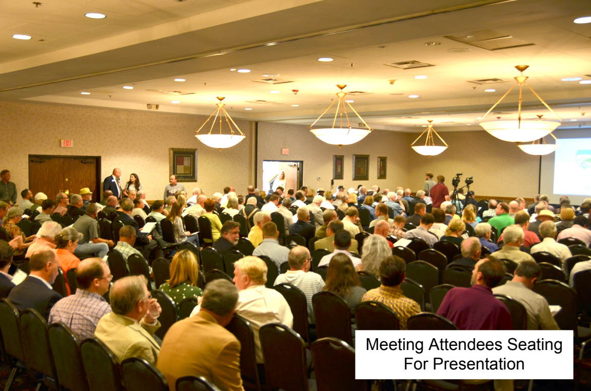
Meeting Attendees Seating For Presentation