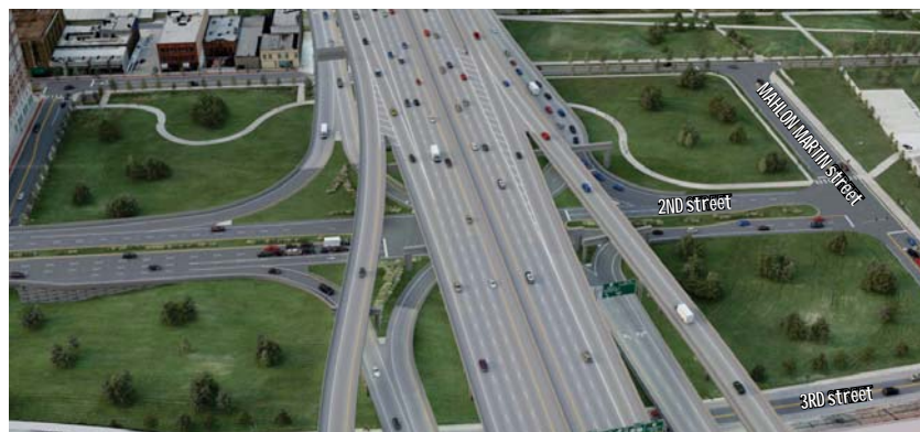
6-LANES WITH COLLECTOR-DISTRIBUTOR LANES ALTERNATIVE