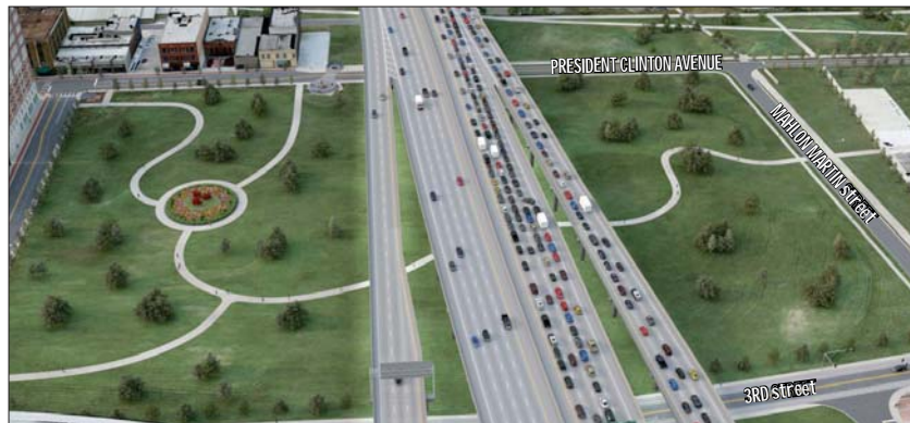
8 GENERAL PURPOSE LANES ALTERNATIVE