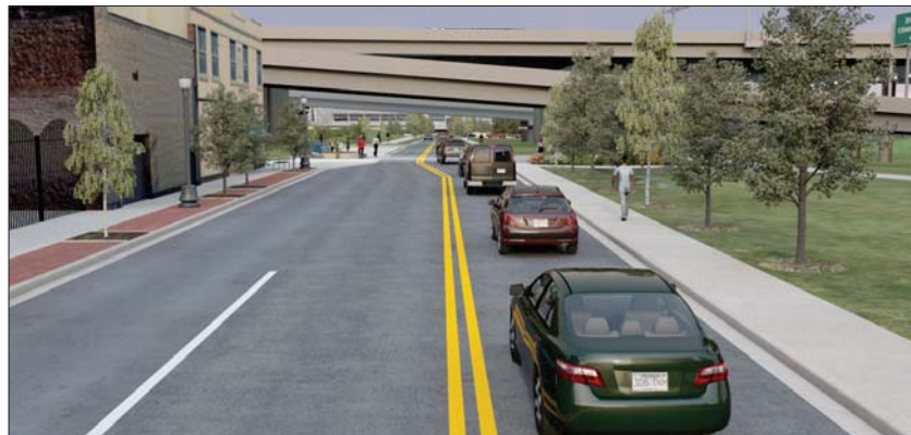
SINGLE POINT URBAN INTERCHANGE ALTERNATIVE