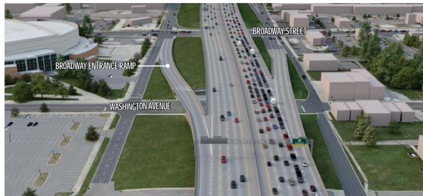
8 GENERAL PURPOSE LANES ALTERNATIVE