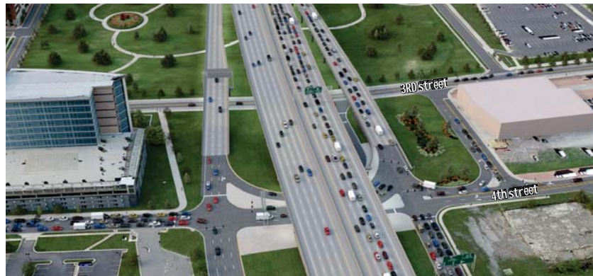
8 GENERAL PURPOSE LANES ALTERNATIVE