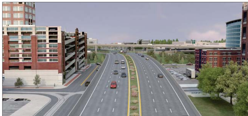
SINGLE POINT URBAN INTERCHANGE ALTERNATIVE