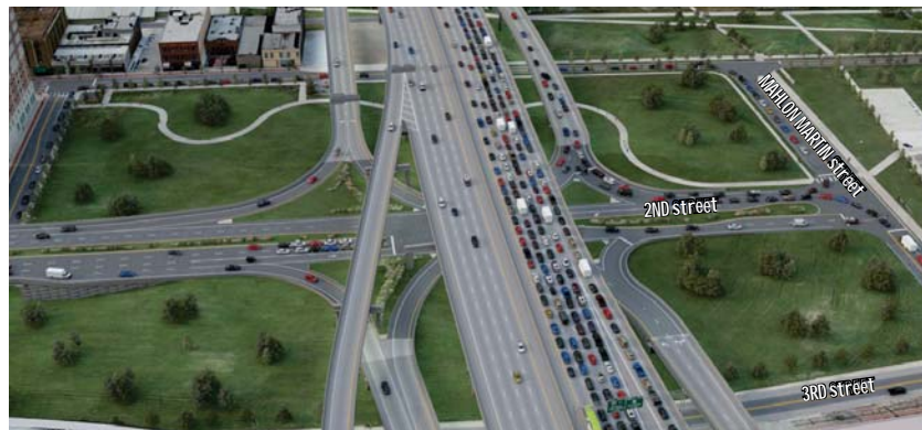
8 GENERAL PURPOSE LANES ALTERNATIVE