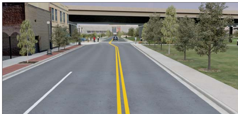
SPLIT DIAMOND INTERCHANGE ALTERNATIVE