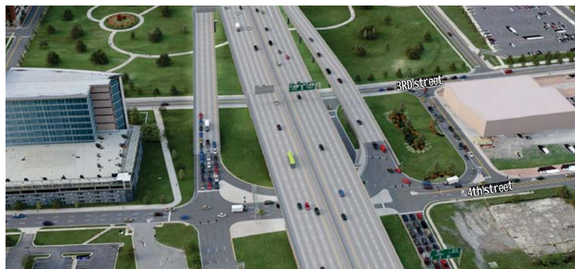
6-LANES WITH COLLECTOR-DISTRIBUTOR ALTERNATIVE