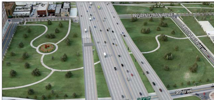
6-LANES WITH COLLECTOR-DISTRIBUTOR ALTERNATIVE