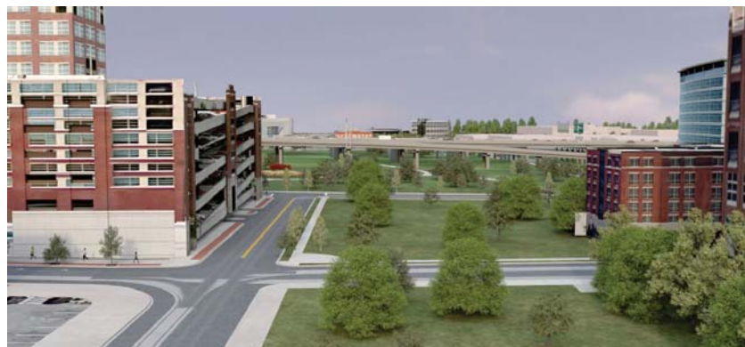
SPLIT DIAMOND INTERCHANGE ALTERNATIVE