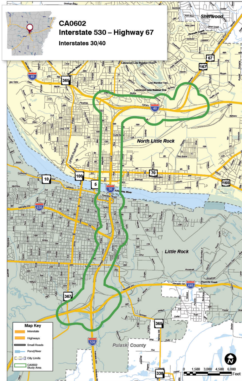
Figure 1. Proposed PEL Study Area