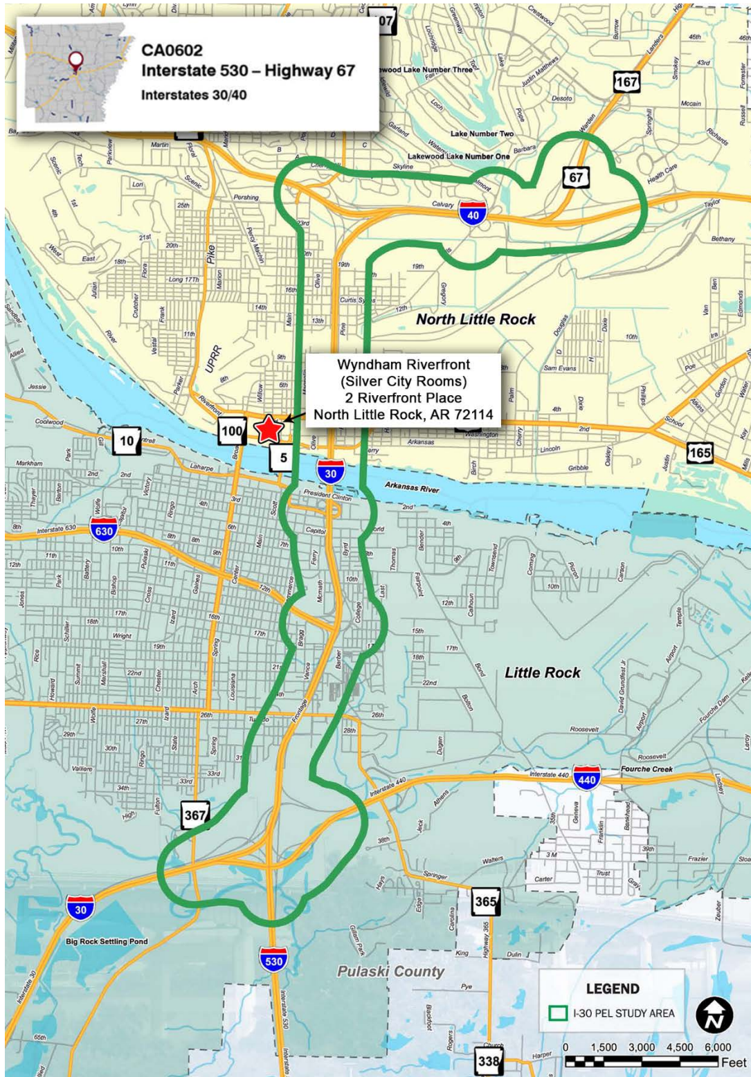
Figure 1. Public Hearing Location